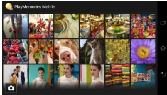
“Thumbnail View” is available for all images taken with the app