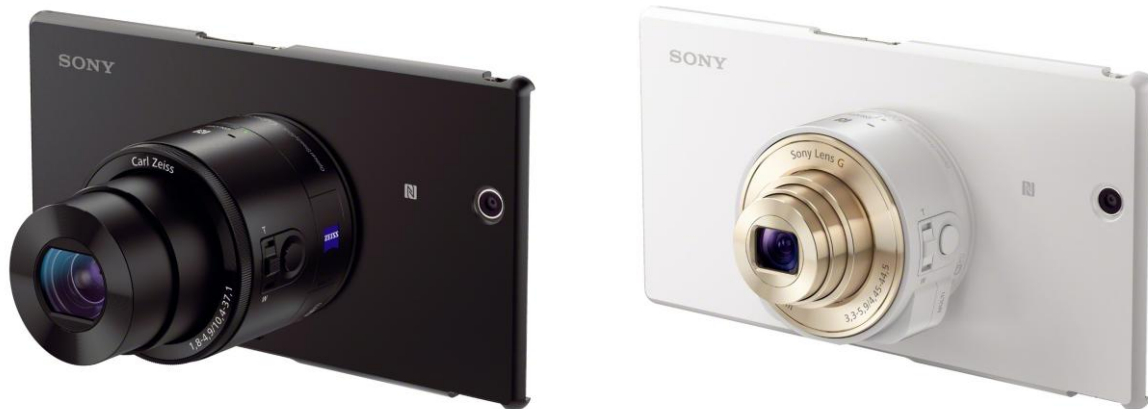
QX attachment case for Xperia™ Z Ultra with Cyber-shot QX100 & QX10

New PlayMemories Mobile™ App version 4.0 adds photo browsing, faster connection speeds; new firmware adds Full HD video shooting, expanded ISO range and more