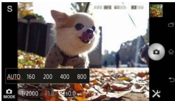
“S” Shutter Priority Mode on QX100