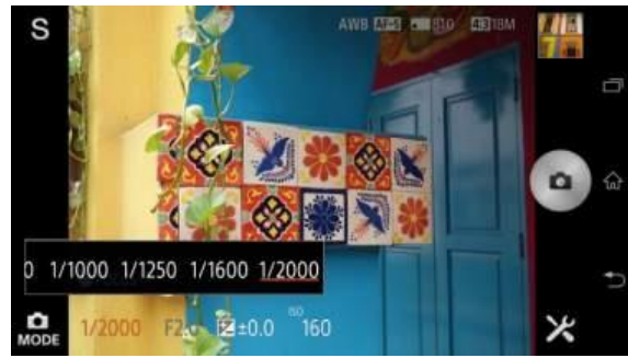
ISO Control on QX100 in “S” Mode

For more information on PlayMemories Mobile™ updates, please visit the following link: http://support.d-imaging.sony.co.jp/www/disoft/int/playmemories-mobile/en/connect/index.html .